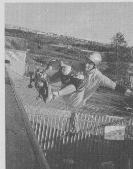
The Morfa ramp

And finally, you may or may not be interested to know, there are new French ramps in Bordeaux, La Rochelle and Biarritz . Thankyou and goodnight.